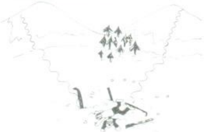
SKI OFF-PISTE AND FIND PROGRES

Get up early for a hard day's skiing in the 'quatres Vallées'. Once you've negotiated Tortin the rest is easy, but there's a lot of ground to cover – so keep moving. Remember, the Tortin lift bringing you back to the Verbier side stops at 4.30 sharp.