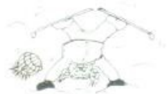
TRADITIONAL SKI PIONEER

Verbier is high - 1500 metres - and you can ski from a height of over 3000 metres down to 820 metres when snow conditions allow. Most years the snow lasts from early December until May, yet the resort is one of the sunniest in the Alps. The scenery is breathtaking.