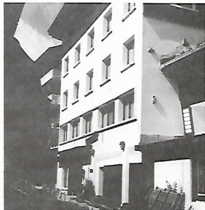
Hotel Le Kern

N.B. Apart from meals provided on the aircraft, no food will be provided during the journeys.