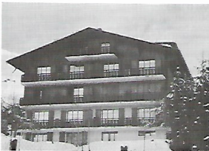
Chalet Sun Valley

* Skiers' breakfast includes fruit juice, boiled eggs and cheese or ham.