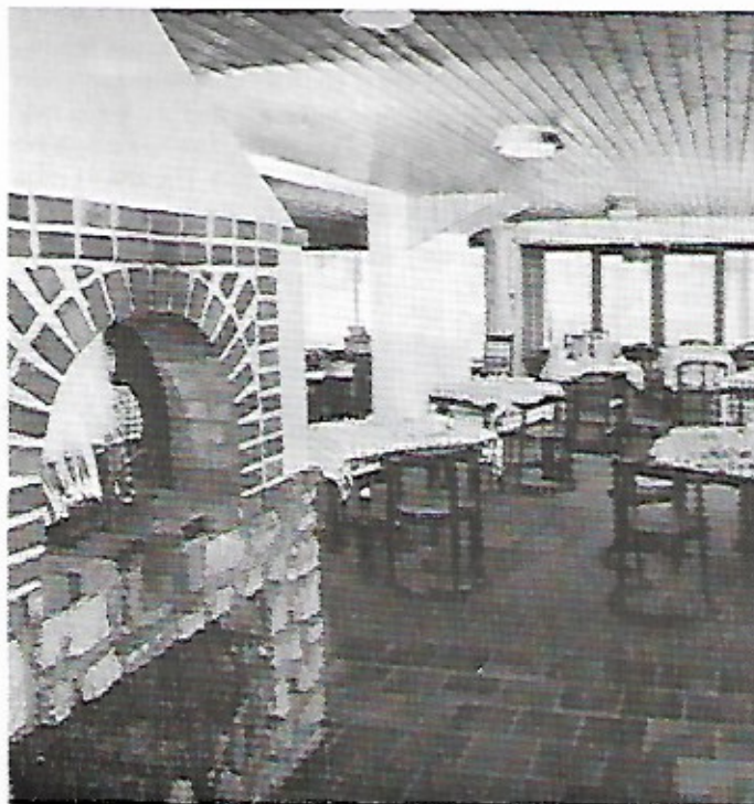
Hotel le Clos, Val d'Isere

We can offer Continental Motor cover for those wishing to drive to the Alps. Please ask us for a quote.