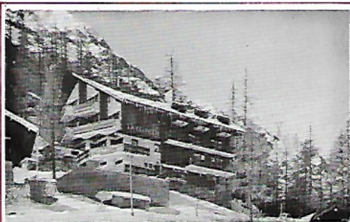
Hotel La Gelinotte, Val d'Isere