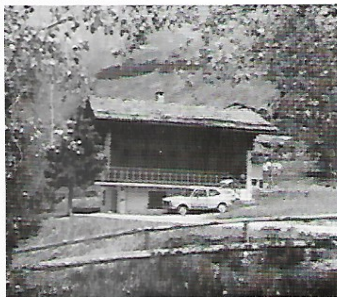
Chalet La Rimaye, Verbier.

Italy — Courmayeur, Cervinia, La Thuile, Bormio, St. Caterina, Selva and Corvara/Colfosco